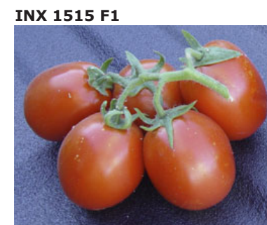
INX 1515 F1

V Verticillium wilt race 1 F1 Fusarium Wilt race 1 F2 Fusarium Wilt race 2 LB Late blight N Nematodes P Bacterial Speck race 0 TSWV Tomato spotted wilt virus