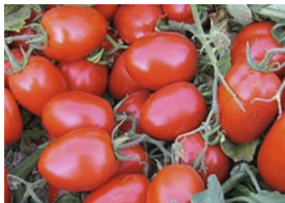
INX 1517 F1