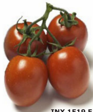
INX 1519 F1